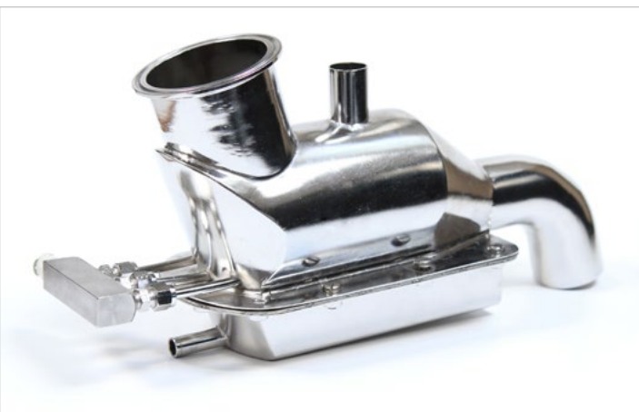
The FT80-60 Fluid Bed Cooler Accessory

Note: Many spray-chilling applications also require the Trace Heating Accessory, FT81-65.