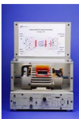
EM-3350-1F DC Compound Wound Motor

Remark : System Transformer is provided at extra charge for the area where 3-phase 220V power is not available.