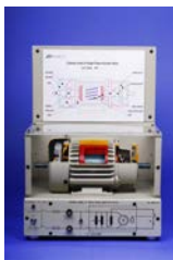
EM-3350-1C Single-phase Induction Motor