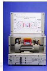
EM-3350-3A Three-phase Salient Pole Synchronous Motor