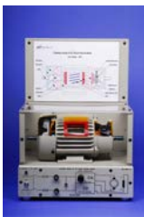
EM-3350-1D DC Shunt Wound Motor