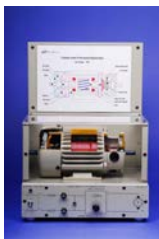
EM-3350-1A DC Permanent-magnet Motor

Cutaway models are made from normal electrical machines. The stator is cut away by 1/4 over the entire length for an optimum view of the internal construction of the machine and it is still operating. The cutaway surfaces are protected against corrosion.