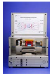
EM-3350-3C Three-phase Squirrel Cage Motor