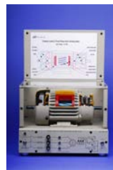
EM-3350-3B Three-phase Rotor Winding Motor