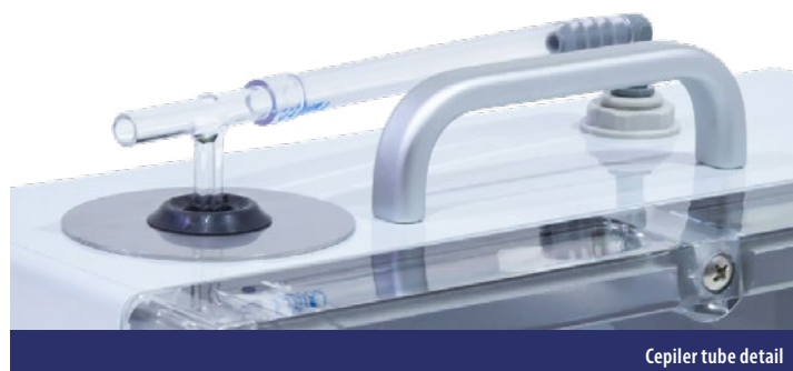
Cepiler tube detail