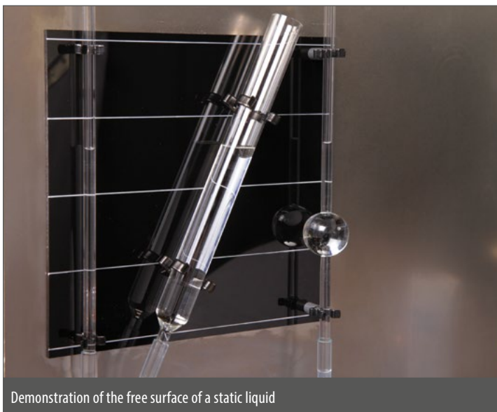
Demonstration of the free surface of a static liquid