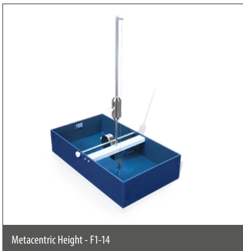
Metacentric Height - F1-14