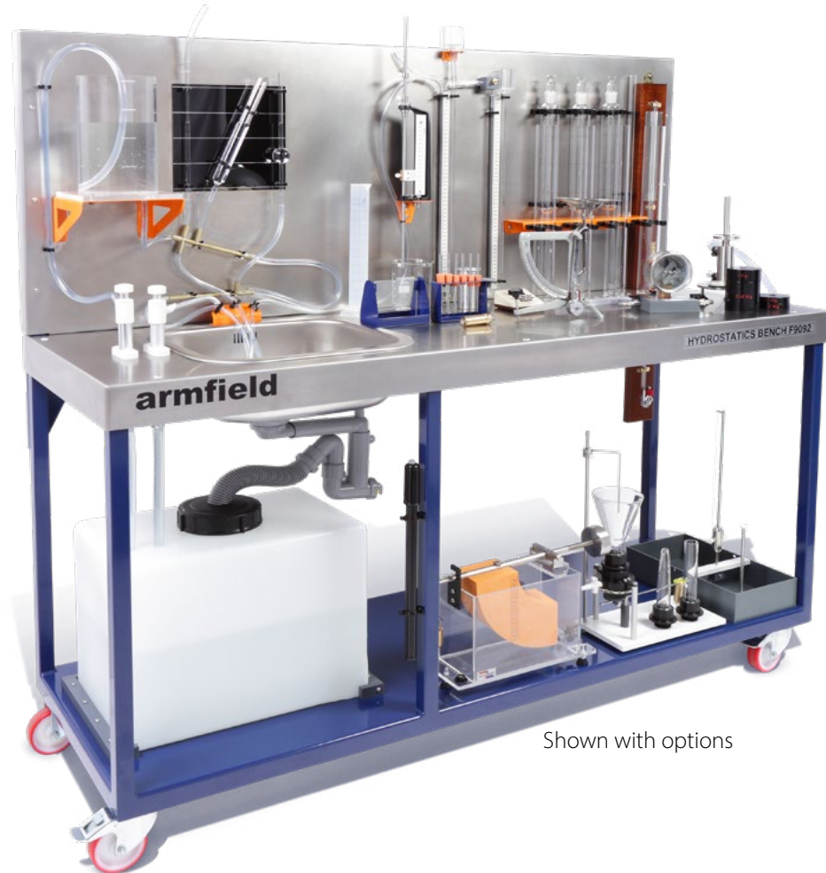
Shown with options

The Armfield Fluid Properties and Hydrostatics Bench is designed to demonstrate the properties of fluids and their behaviour under hydrostatic conditions (fluid at rest). This enables students to develop an understanding and knowledge of a wide range of fundamental principles and techniques, before studying fluids in motion.