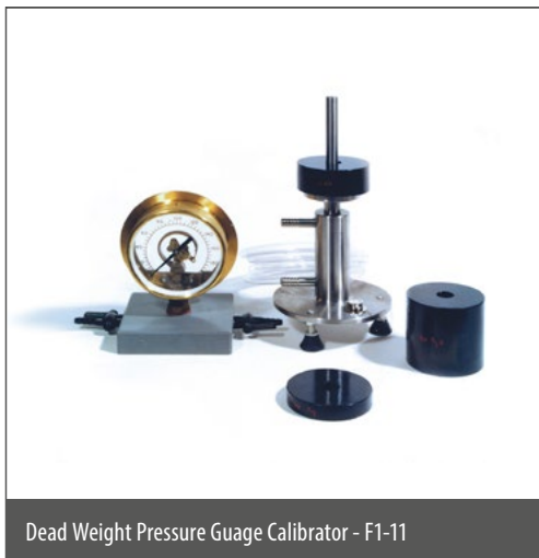
Dead Weight Pressure Gauge Calibrator - F1-11