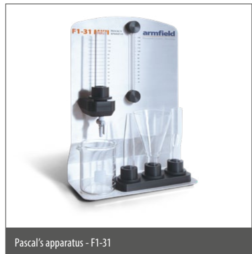
Pascal's apparatus - F1-31