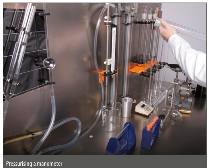
Pressurising a manometer